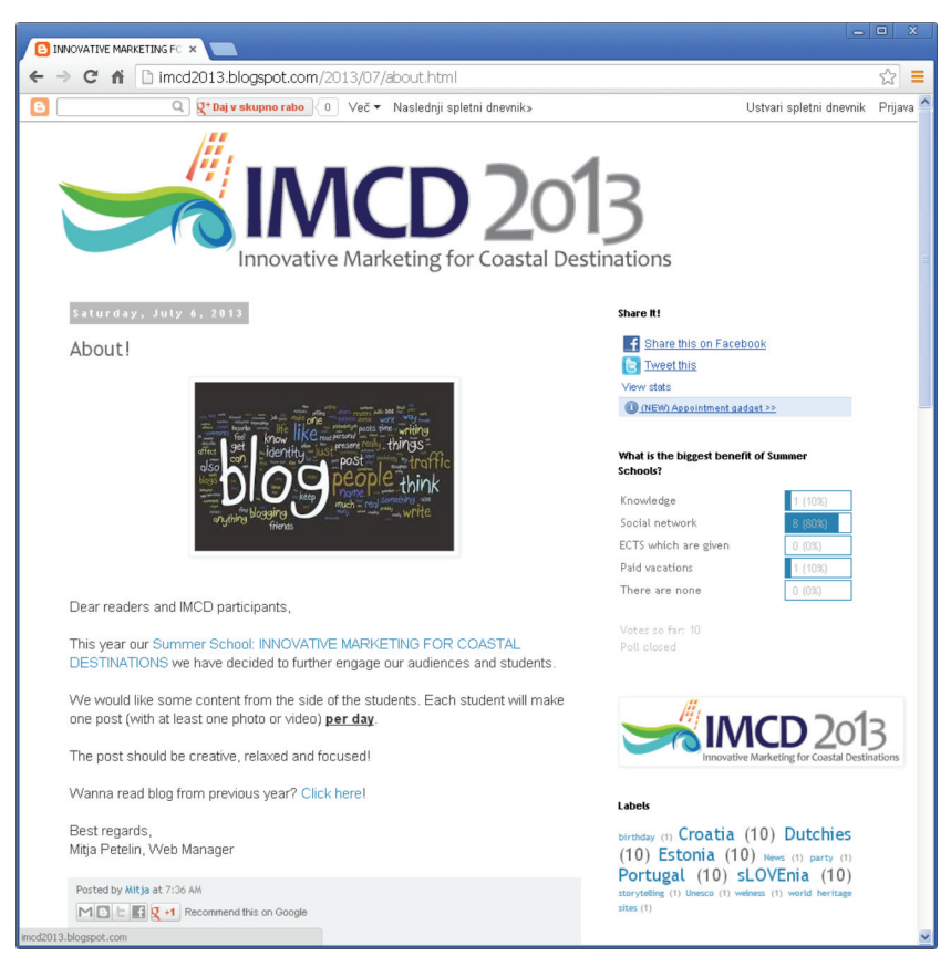
FIGURE 1 Blogger Landing Page and Layout

engage audiences. Promotion of their blog posts via social media channels was one of the most important guidelines.