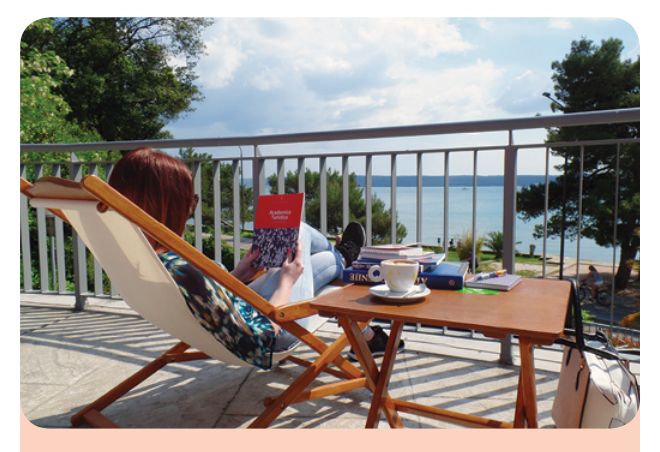
ENTER THE WORLD OF TOURISM THROUGH THE DOORS OF TURISTICA.

In addition to study activities, a wide range of other events takes place at Turistica, including the conferences Encuentros and TIM (Tourism, Education and Management), round tables FuTuristica, and the gallery AvanTuristica.