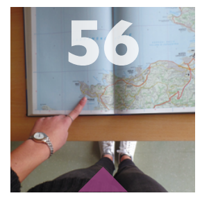
Enrollment for foreign citizens